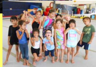
Working on art and making silly faces